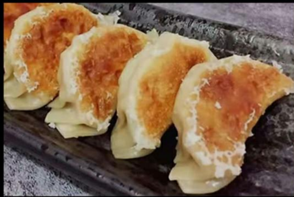
E10) Japanese dumpling 4PCS 6.50€ pork and vegetables) 1a (wait 10 minutes)