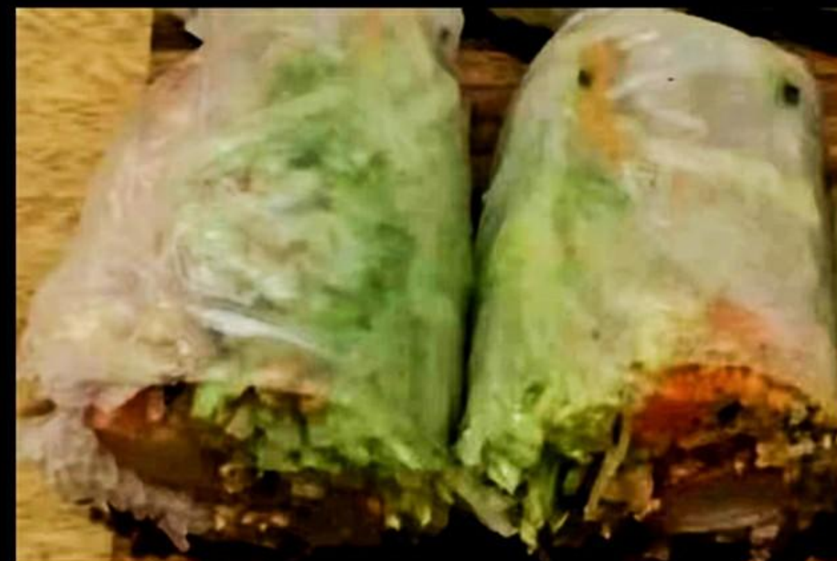
E9) Cold Spring Rolls 2 PCS 6.40€ (Lettuce Carrots Wakame cucumber. fried- onions)