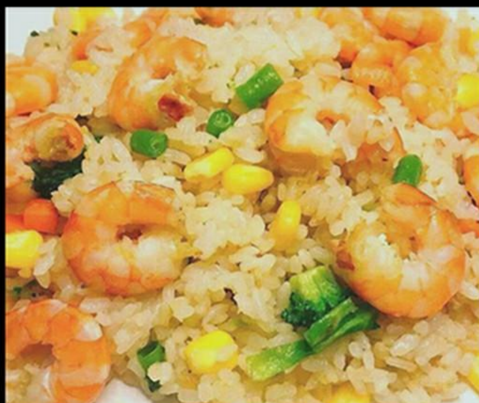
N7/R7 N7 Fried noodles 1a,3,6 /R7 Fried rice 3,6 with Prawns 16.00€