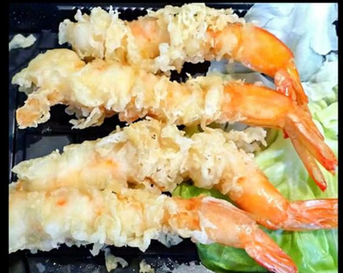
E6 Crispy Scampis 5PCS 6.50 € 1a,3