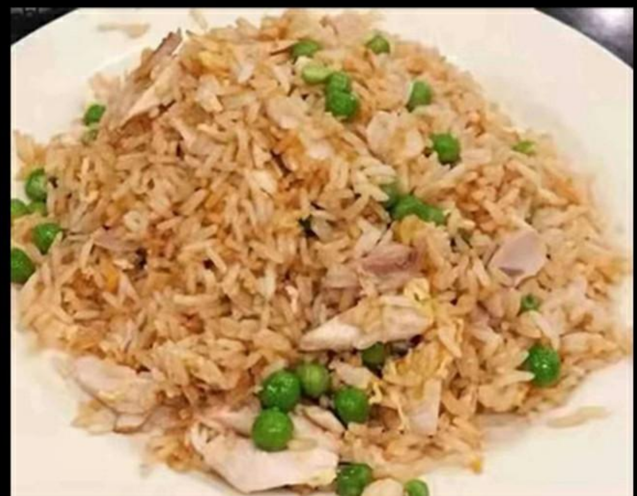
F6 Fried rice 3,6 or fried noodles 1a,3,6 with chicken 13.30 €