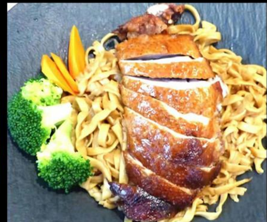
N6/R6 N6 Fried noodles 1a,3,6 /R6 Fried rice 3,6 with duck 14.90€