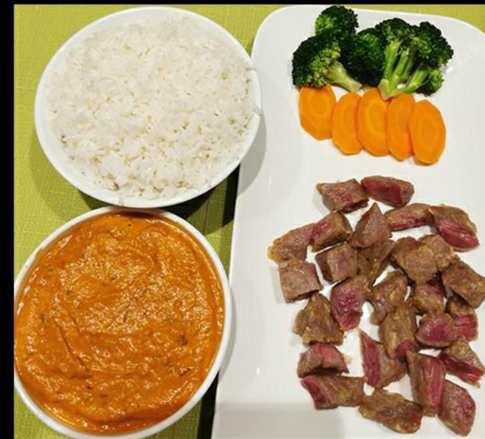
C3 beef curry with plain rice /plain noodles 1a 17.90€