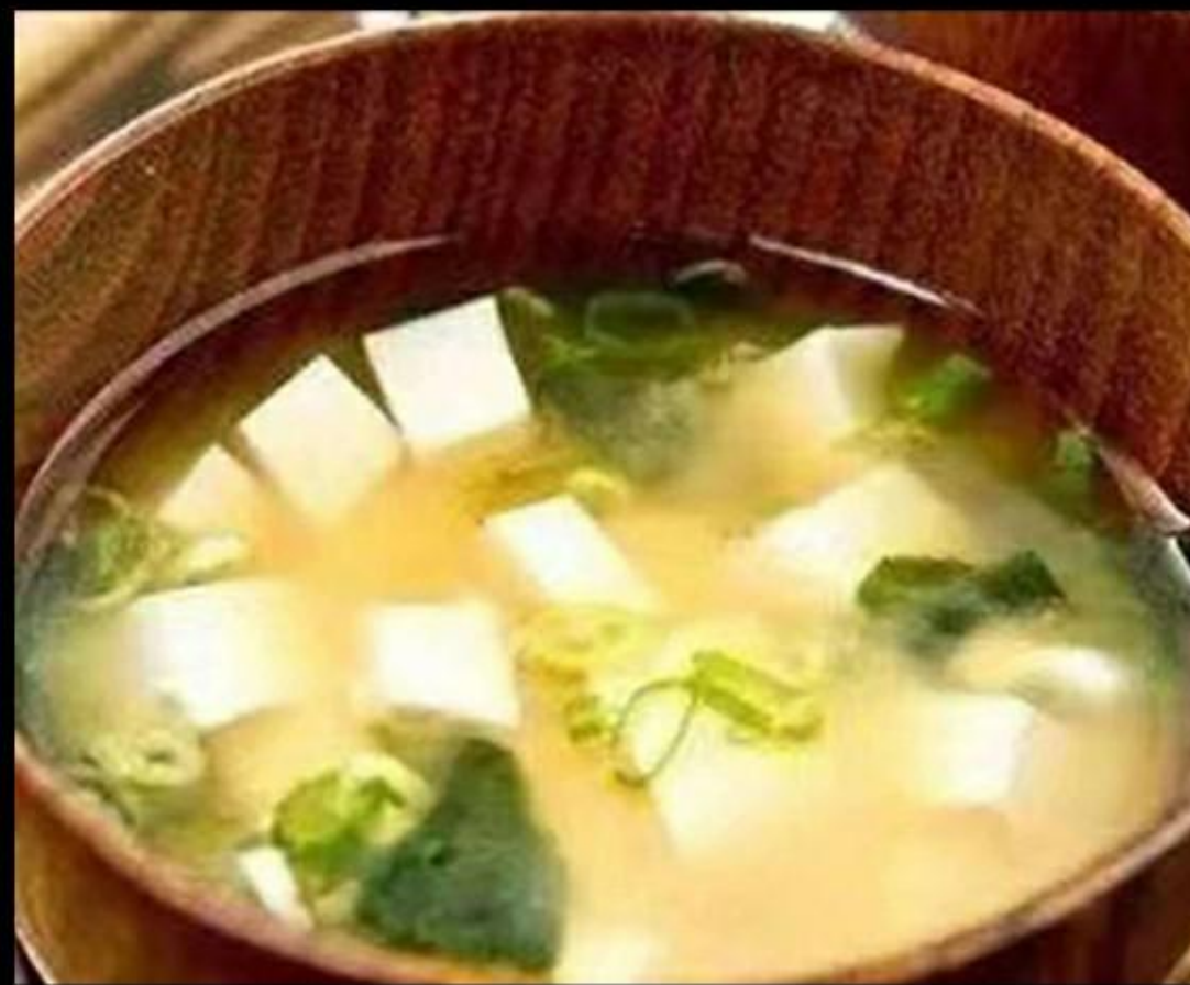
Miso soupe 6 (Tofu and seaweed) 4.50 €