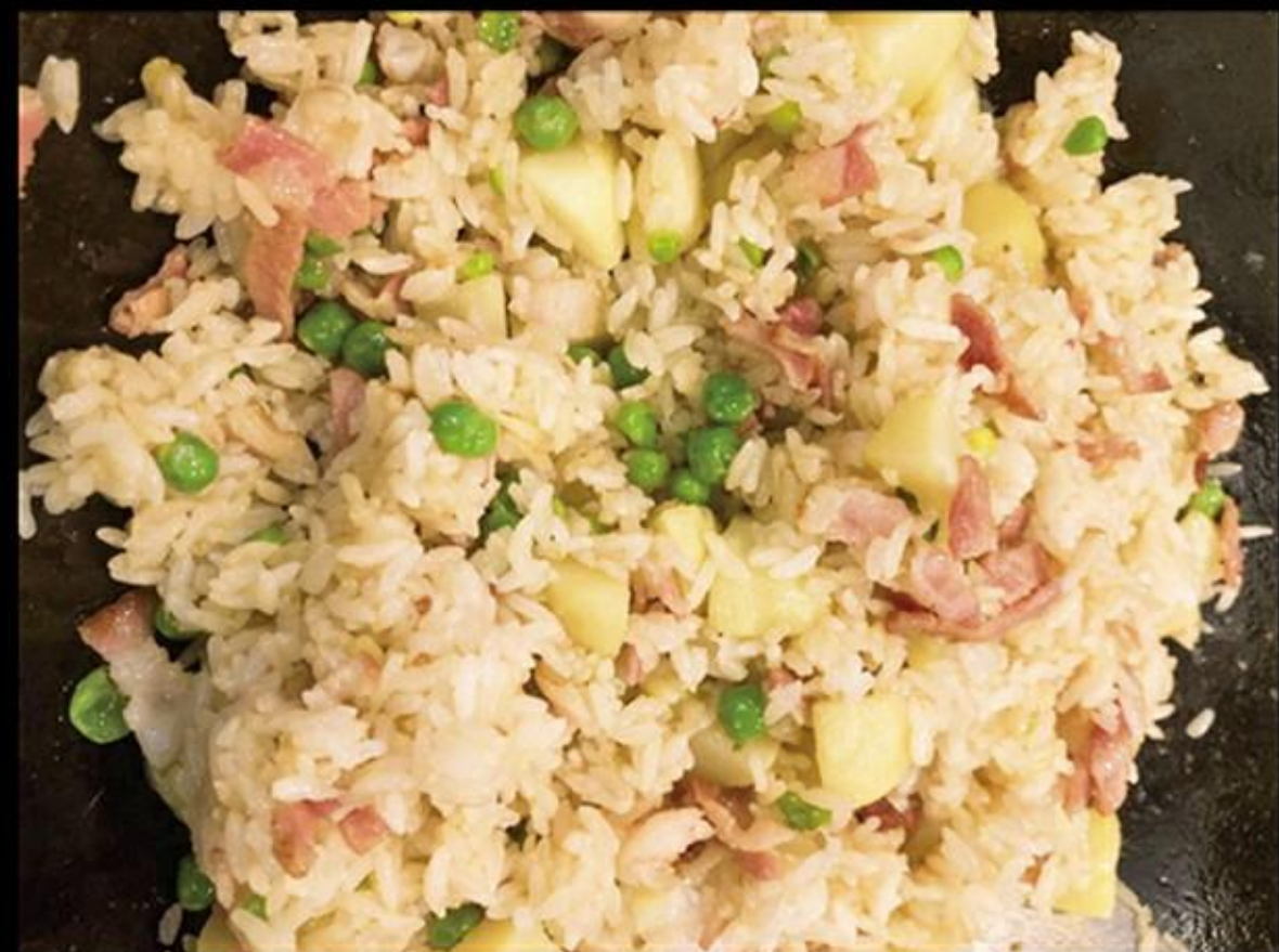
F8 Fried rice 3,6 or fried noodles 1a,3,6 with bacon (porc) 13.30 €