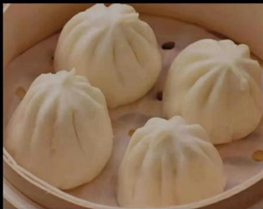
E11) Baby Bao 4PCS 5.80 € (pork and vegetable) 1a (wait 10 minutes)