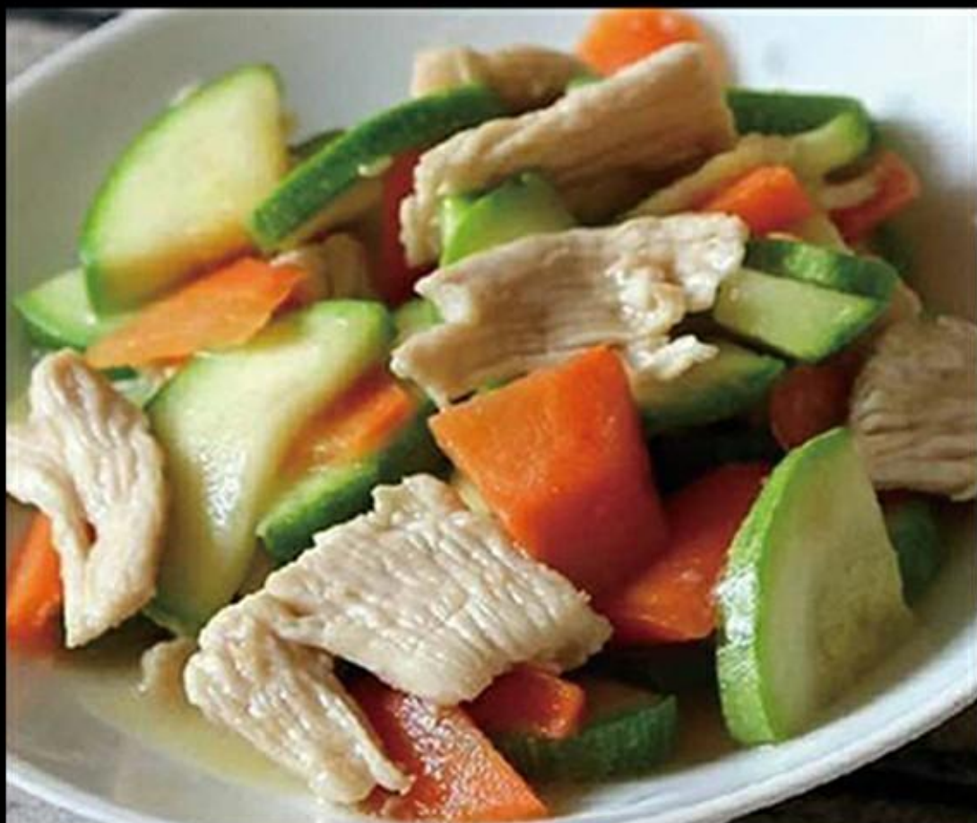
L4 Chicken and mix well cooked vegetables 6 with Rice /Noodles 1a 15.80€