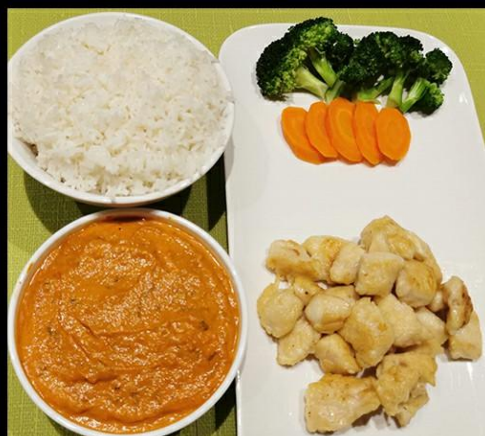
C2 Chicken curry with plain rice /plain noodles 1a 16.90€