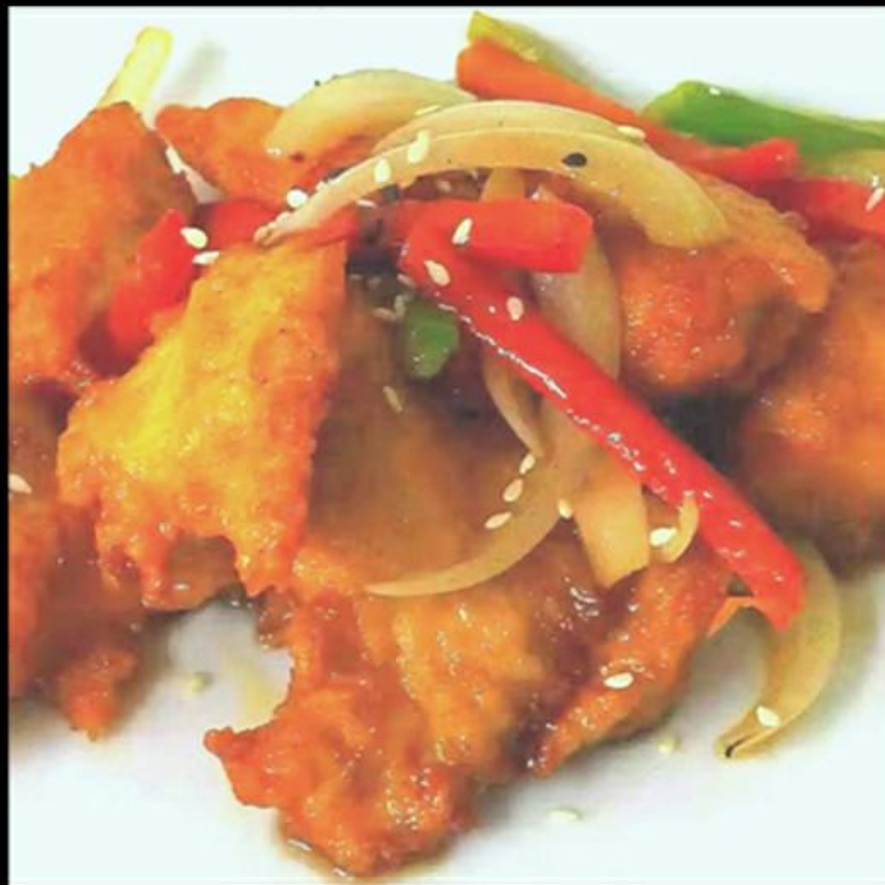
F3 Crispy chicken 11 with rice 13.30€ ( attention: this food is oily for better taste the base is plain rice)