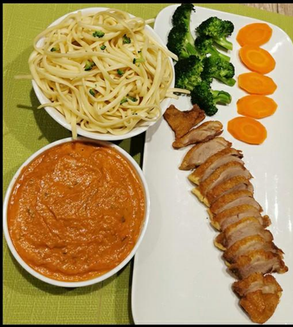
C4 Duck curry with plain rice /plain noodles 1a 18.90€