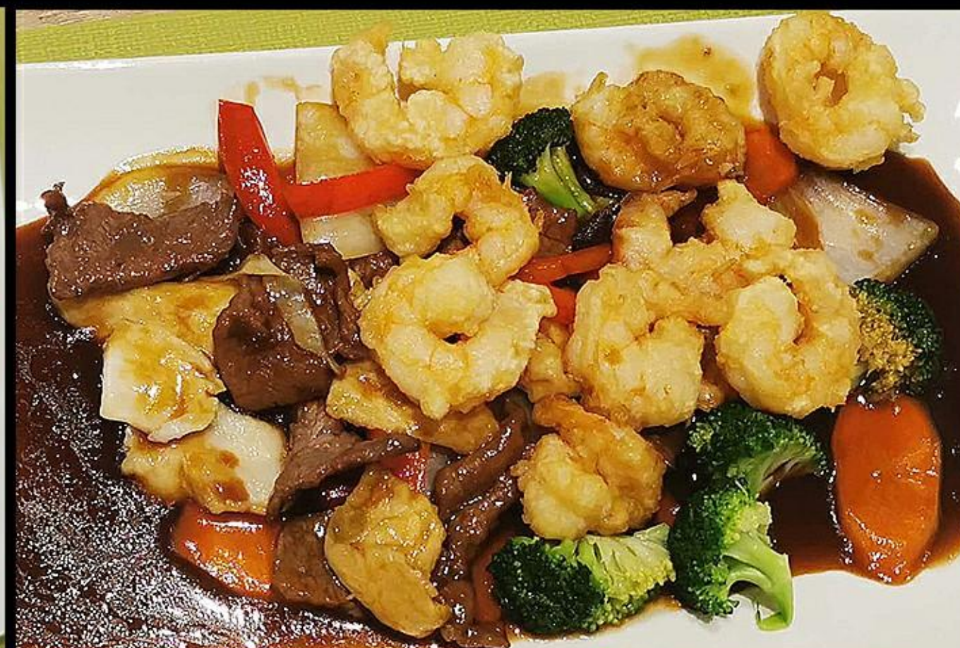
L6 : mix Veg. 6 and mix meat (Chicken, Beef, Prawns) with Rice /Noodles 1a 21.90€