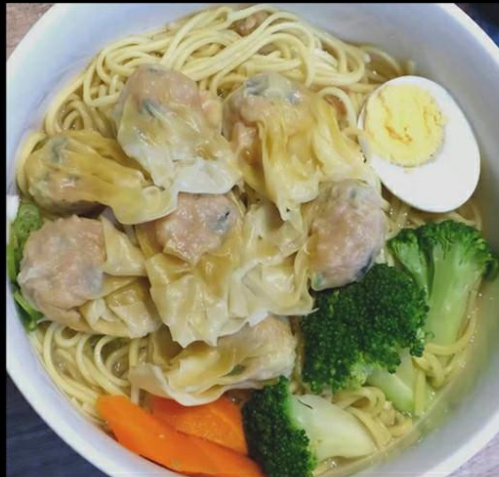
P3 WangTan 1a with soup 3,6 ( pork shrimp and veg.) 15.50€ base food choice: egg noodles 1a,3,6 /rice noodles 3,6