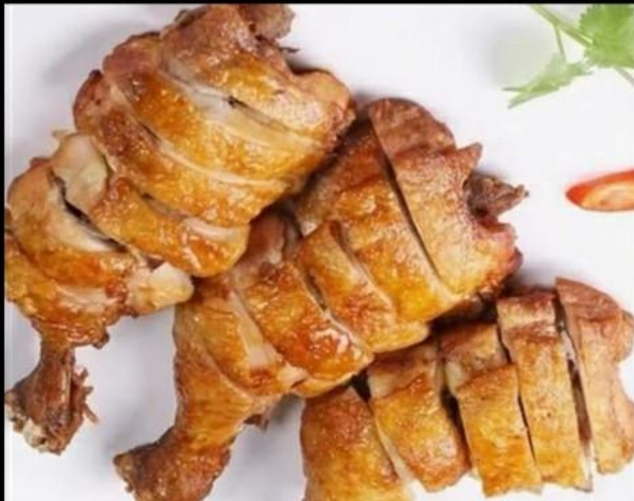
N4/R4 N4 Fried noodles 1a,3,6 /R4 Fried rice 3,6 with chicken legs 14.50€