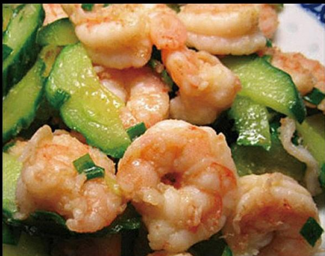
L1 Prawns 3 and mix well cooked vegetables 6 with Rice /Noodles 1a 17.50€

( Attention : The foods below with plenty of sauce for better taste the base is plain rice or plain noodles )