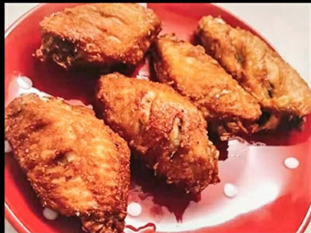
E4) chicken wings 5PCS 5.80 € 1a