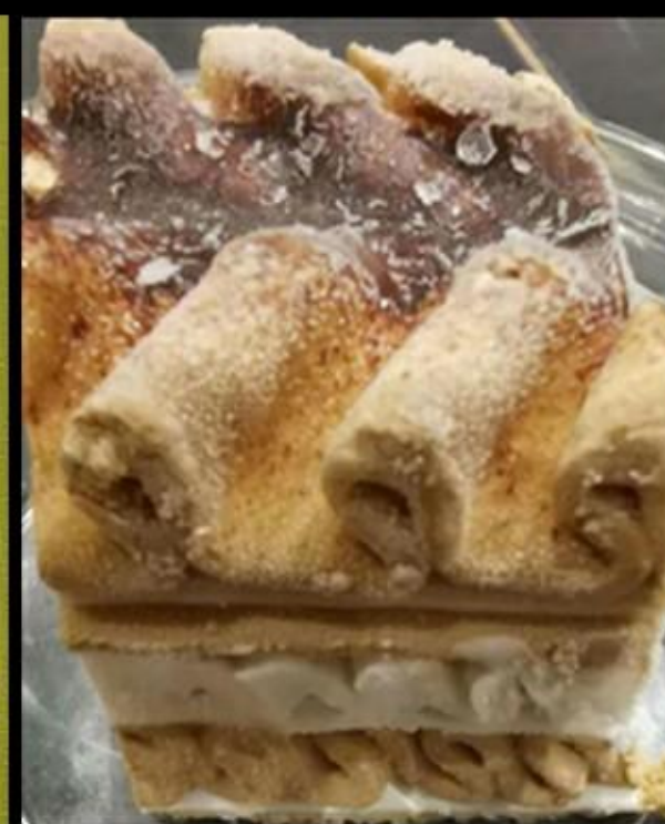
D4 ici cream 7a 5.00€