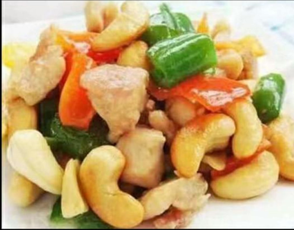
F1 cashew nuts chicken 11 with rice /Noodles 1a 13.30€ ( attention: the food has plenty of sauce for better taste the base is plain rice or plain noodles 1a )