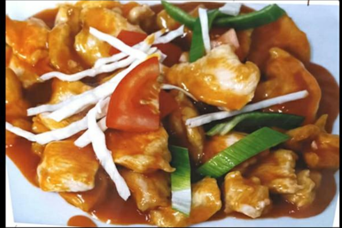
F2 curry chicken (Thai sweet curry, bought from outside) with plain rice /plain noodles 1a 13.30€