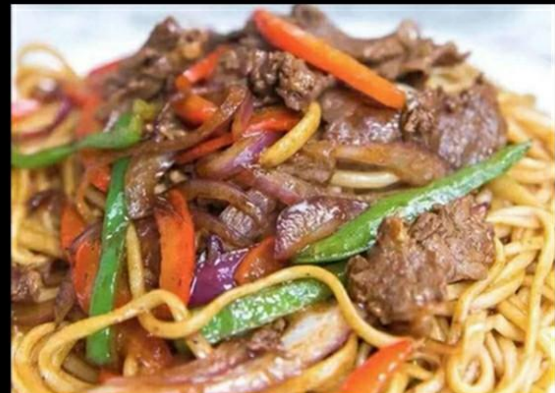
N2/R2 onions beef 6 with N2 noodles 1a /R2 rice 15.90€, pure beef: 202G. (attention: This food has plenty of sauce for better taste the base is plain rice or plain noodles 1a )