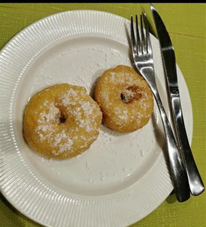
D1 pineapple dessert 1a 5.00€