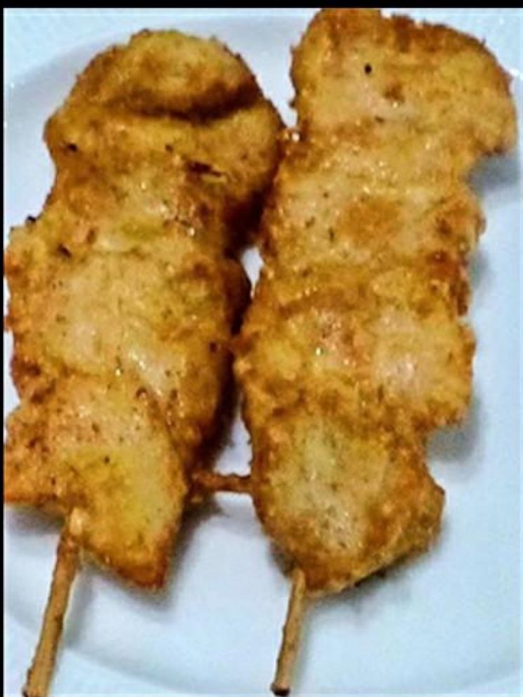
E7) Yakitori skewers (chicken) 2PCS 4.80 € 1a