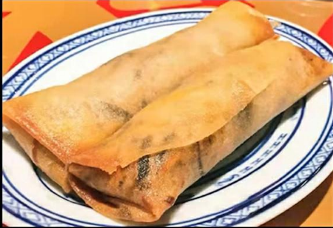
E1) Homemade croquettes 2PCS (Vegetable) 4.80 € 1a