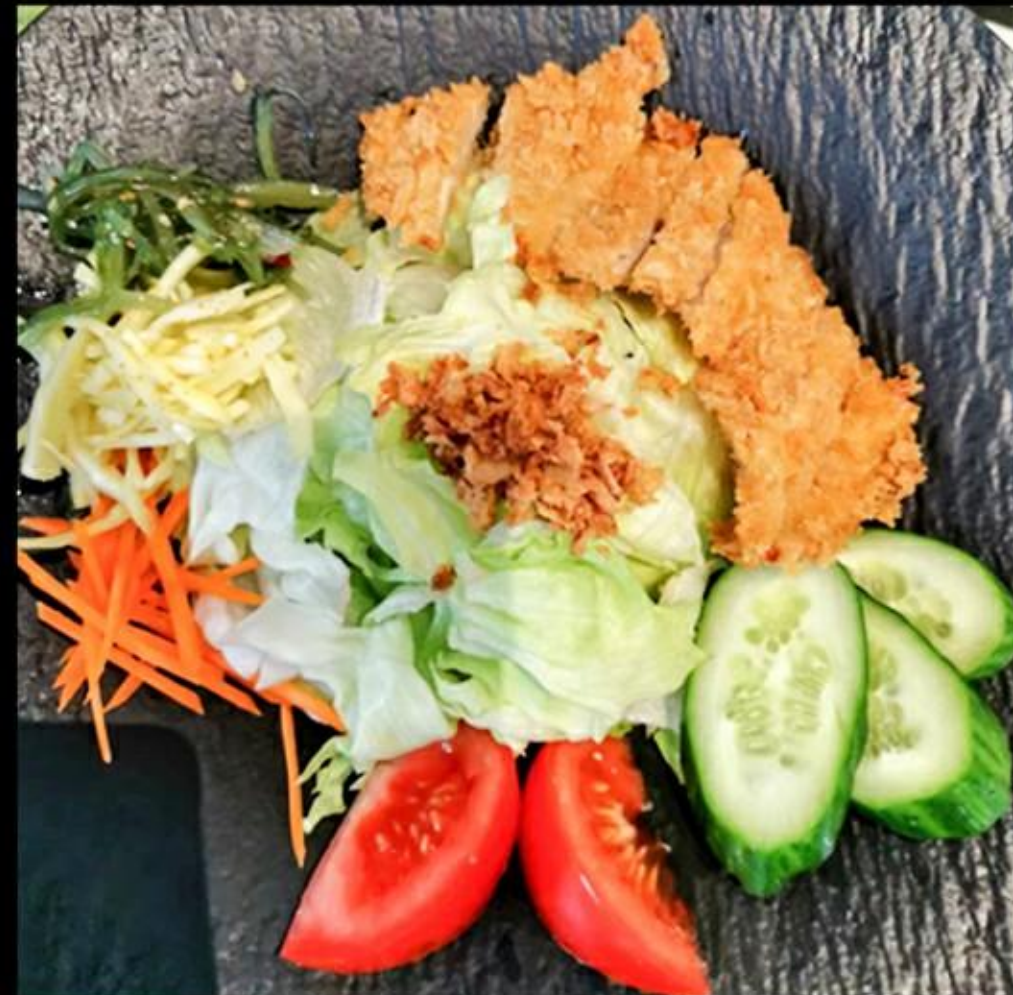
E8) Crispy chicken salad 12.80 € 1a (Lettuce Carrots Cucumber Wakame crispy chicken steak)