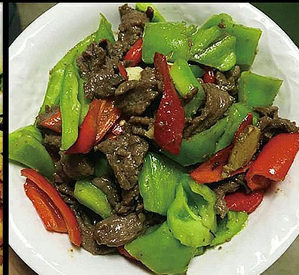
L3 Beef and mix well cooked vegetables 6 with Rice /Noodles 1a 16.90€ pure beef 205G.