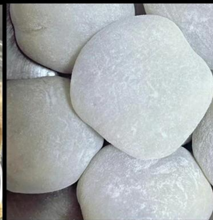
D5 Glutinous Rice Dumplings 3PCS 5.50€