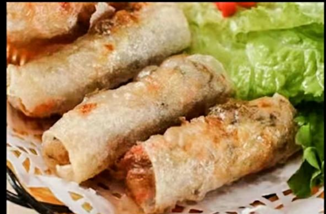
E3) Vietnam rolls 3PCS (chicken) 5.50 €