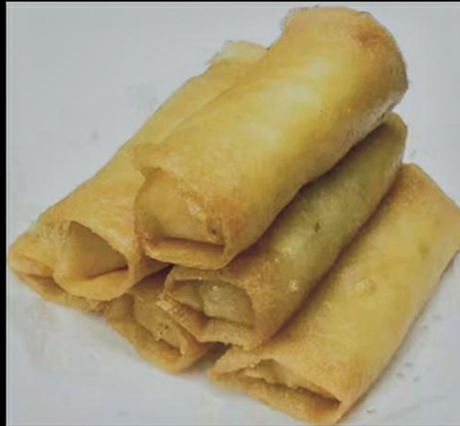
E2) Mini croquettes 6PCS (Vegetable) 5.20 € 1a