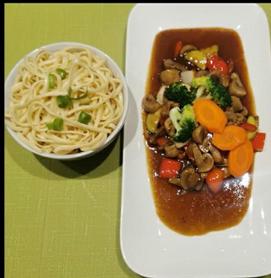
L5 Mix Vegetables 6 with Rice /Noodles 1a 13.30€