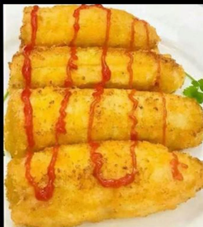
D2 banana dessert 1a 5.00€