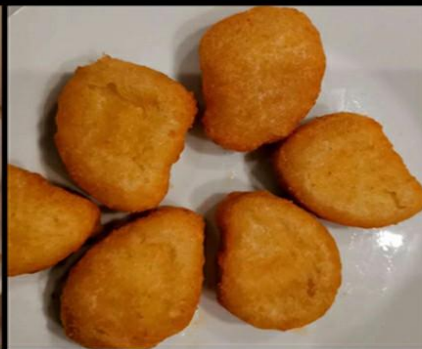
E12) Nuggets 5PCS 4.80 € (chicken) 1a