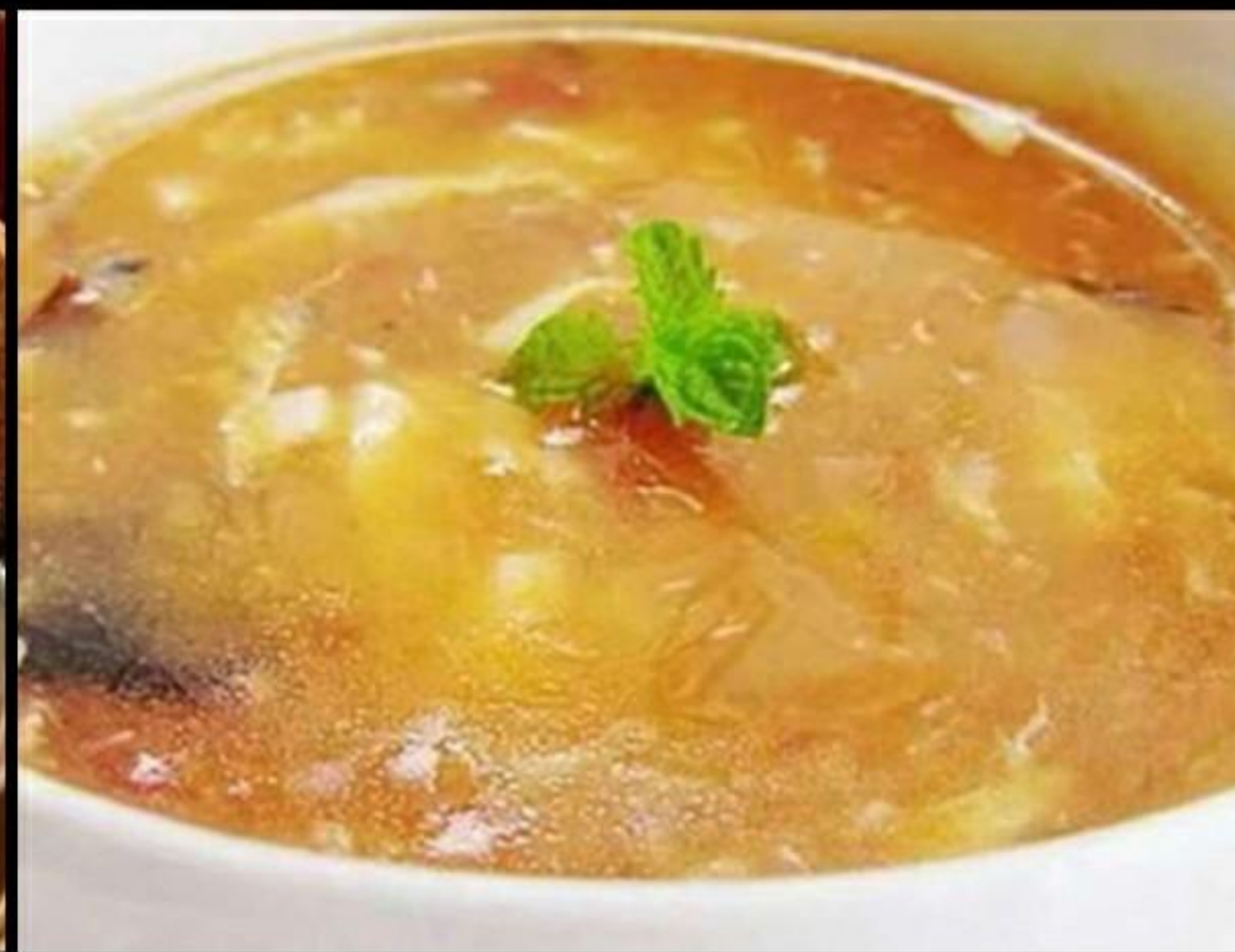
Sour and spicy soup 3 5. 50€ (egg. mushroom. Chicken. Chili)