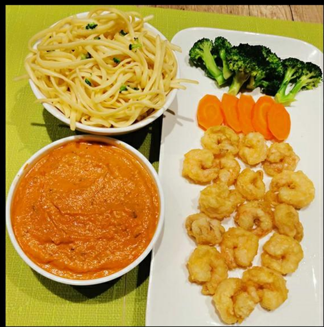
C5 Prawns curry with plain rice /plain noodles 1a 19.90€