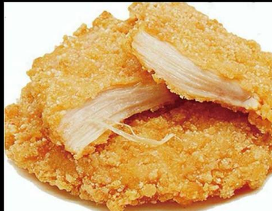
N5/R5 N5 Fried noodles 1a,3,6 /R5 Fried rice 3,6 with chicken escalope 1a,3,6 very crispy 14.30€