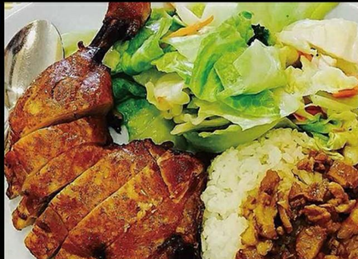
L2: Duck and mix well cooked vegetables 6 with Rice /Noodles 1a 16.90 €