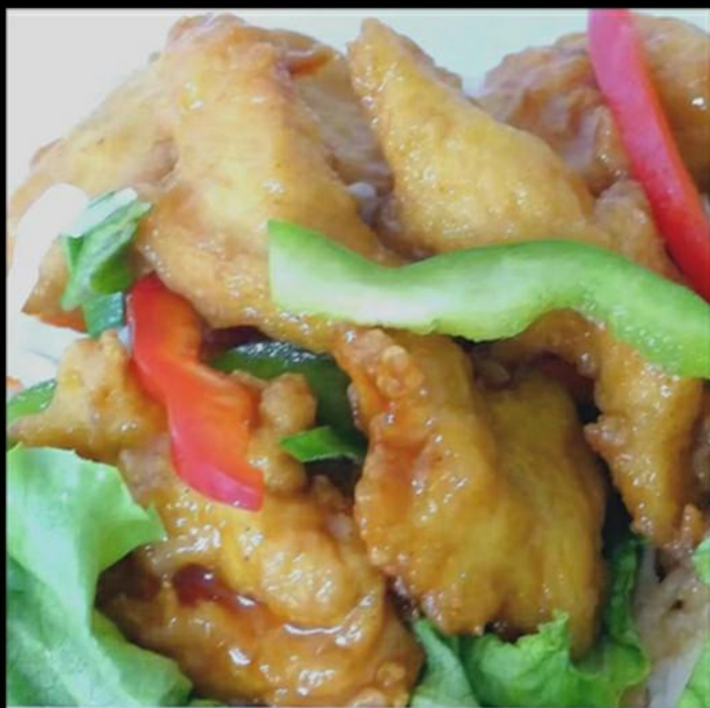
F5 sweet sour and spicy chicken with rice /Noodles 1a 13.30 € ( attention: the food has plenty of sauce for better taste the base is plain rice or plain noodles 1a )