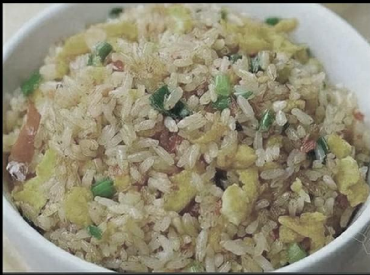
F7 Fried rice 3,6 or fried noodles 1a,3,6 with egg 3 and vegetables 12.50€