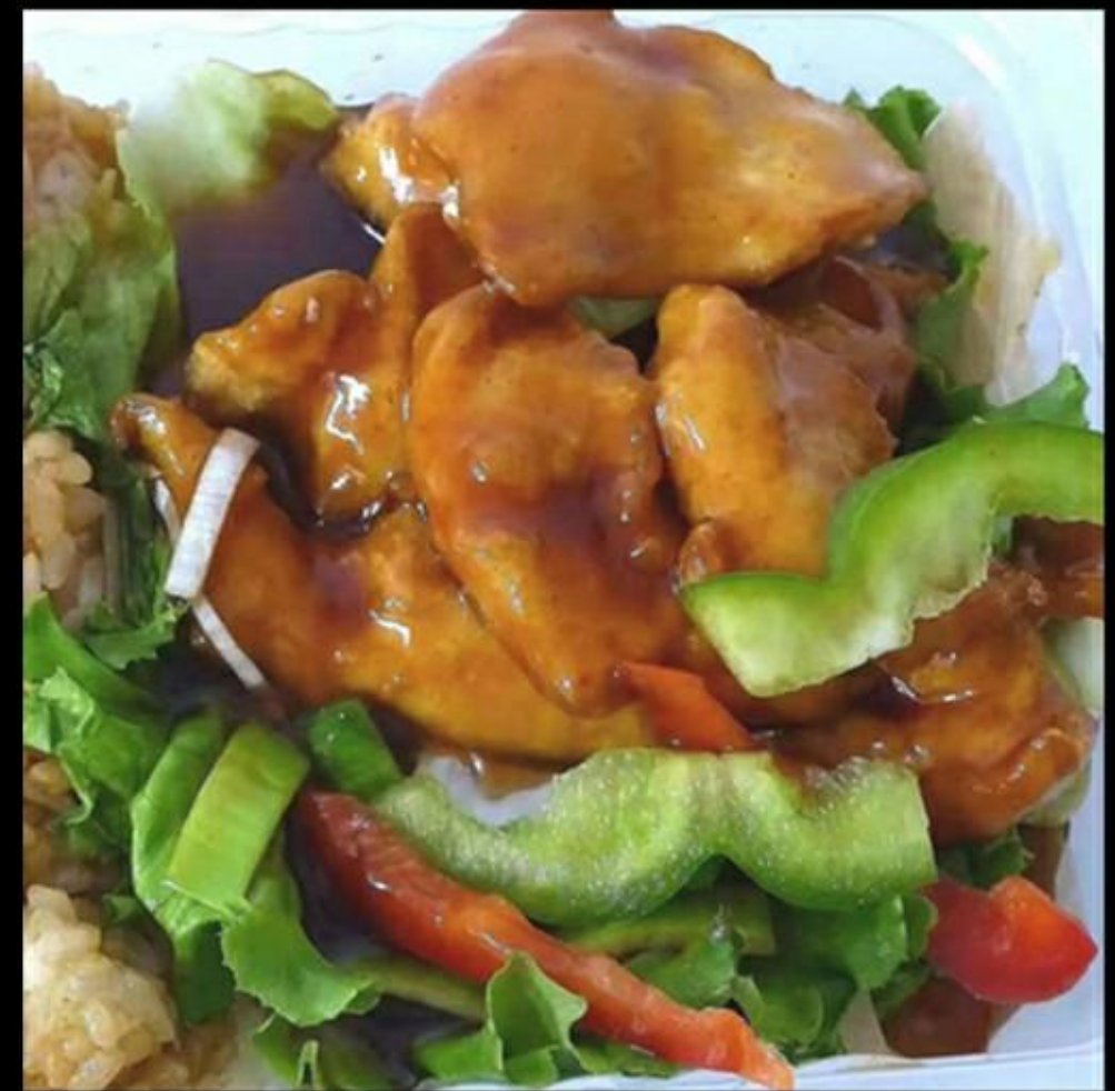
F4 caramelized chicken 6 with rice /Noodles 1a 13.30€ ( attention: the food has plenty of sauce for better taste the base is plain rice or plain noodles 1a )