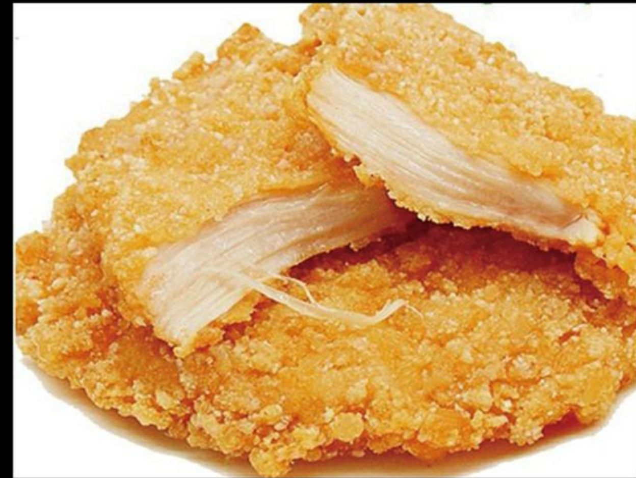
P4 Chicken escalope 1a,3 very very crispy with soup 14.90 € base food choice : egg noodles 1a,3,6 /rice noodles 3,6