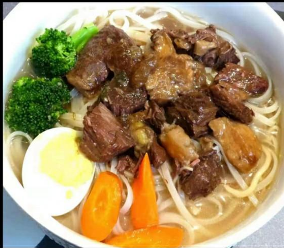
P1 stew of beef with soup 3,6 15.50€ base food choice: egg noodles 1a,3,6 /rice noodles 3,6