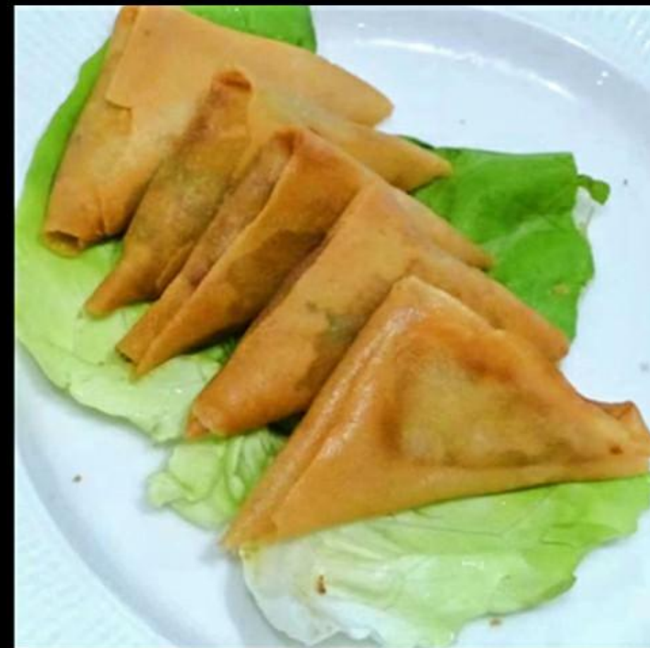
E5) Curry triangular fritters 6PCS (Vegetable) 5.20€ 1a