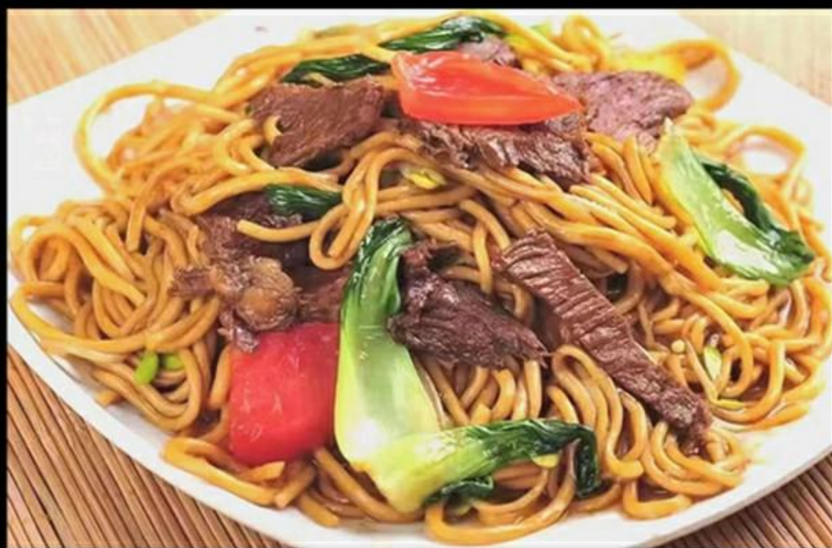
N1/R1 N1 Fried Noodles 1a,3,6 /R1 Fried rice 3,6 with beef 14.30€

Sauce for noodles choice : fried noodles or sesame sauce noodles