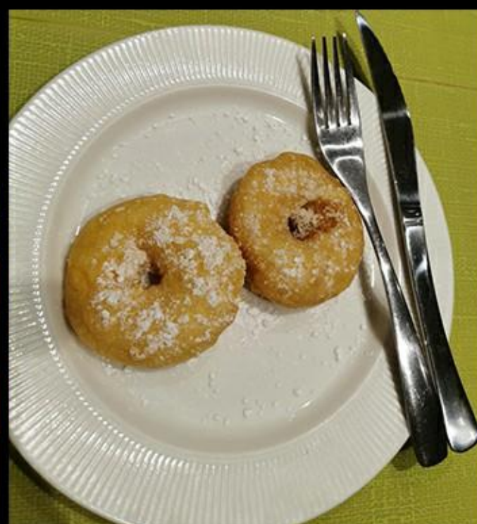
D3 Appel dessert 1a 5.00€