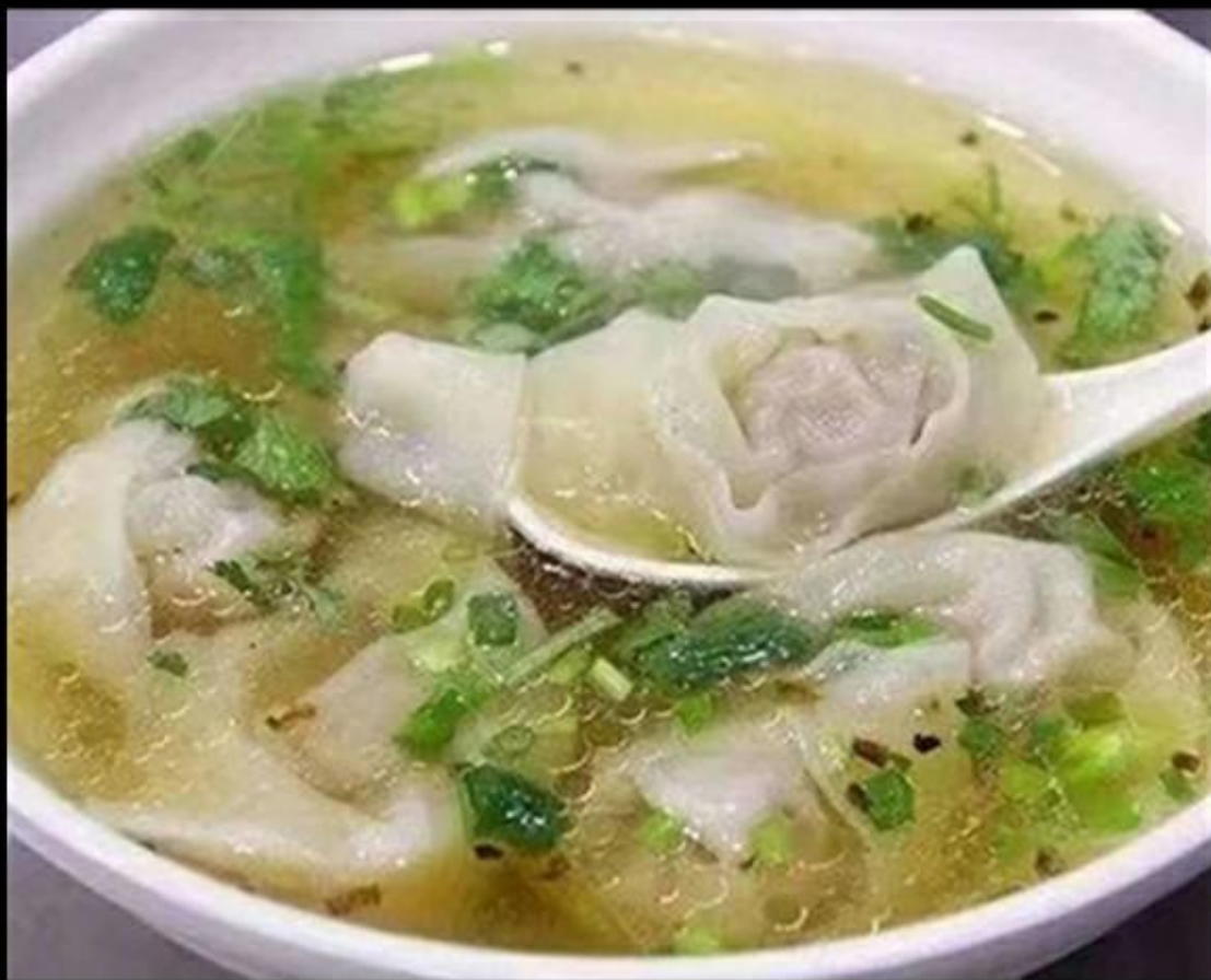
WanTan soup 1a (pork veg. shrimp) 5.90 €