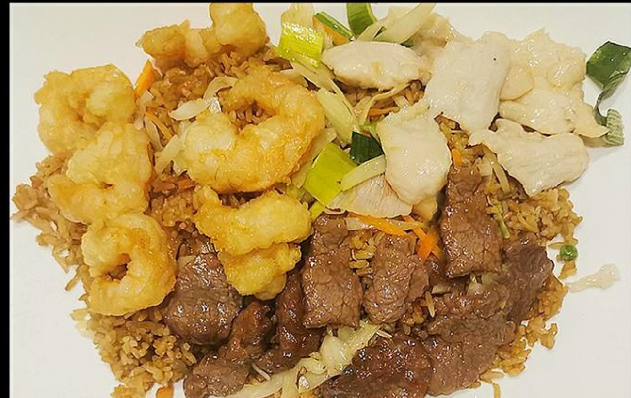
N8/R8 N8 Fried noodles 1a,3,6 /R8 Fried rice 3,6 with mix meat ( Chicken, beef, Prawns) 19.90€